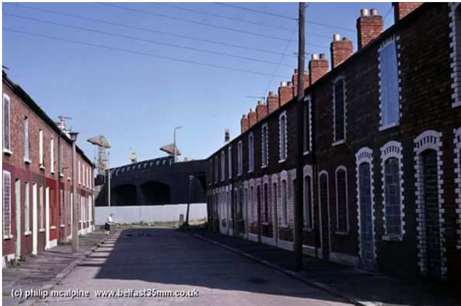
Humber Street 1943 off Dee Street

A lot of family connections can be linked to this street. In the 1943 resident listing below there are still a large number of 'family' present.